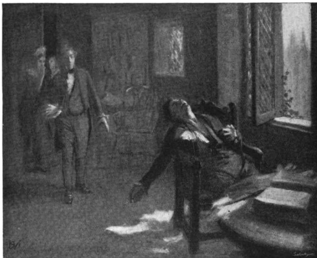
"Mr. Abney was found in his chair, his head thrown back."

least, it will be well to conceal: a disused bathroom or wine-cellar will be found convenient for such a purpose. Some annoyance may be experienced from the psychic portion of the subjects—which popular language dignifies with the name of ghosts. But the man of philosophic temperament—to whom alone the experiment is appropriate—will be little prone to attach importance to the feeble efforts of these beings to wreak their vengeance on him. I contemplate with the liveliest satisfaction the enlarged and emancipated existence which the experiment, if successful, will confer on me; not only placing me beyond the reach of human justice, but eliminating to a great extent the prospect of death itself."