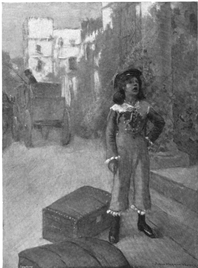
"The little boy . . . looked about him with the keenest curiosity."

he had written a remarkable series of articles in the Critical Museum on the superstitions of the Romans of the Lower Empire. He was looked upon, in fine, as a man wrapped up in his books, and it was a matter of great surprise among his neighbours that he should ever have heard of his orphan cousin Stephen Elliott, much more that he should have volunteered to make him an inmate of Aswarby Hall.