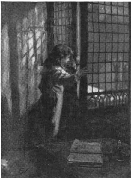
"Stephen was standing at the open window of his bedroom."

into the park, he felt as if an endless procession of unseen people were sweeping past him on the wind, borne on resistlessly and aimlessly, vainly striving to stop themselves, to catch at something that might arrest their flight and bring them once again into contact with the living world of which they had formed a part. After luncheon that day Mr. Abney said: "Stephen, my boy, do you think you could manage to come to me to-night as late as eleven o'clock in my study? I shall be busy until that time, and I wish to show you something connected with your future life which it is most important that you should know. You are not to mention this matter to Mrs. Bunch nor to any one else in the house; and you had better go to your room at the usual time."