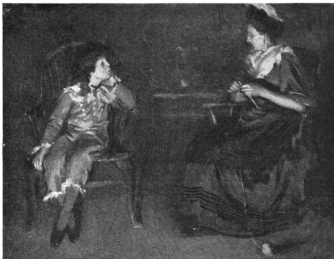
"'Is Mr. Abney a good man, and will he go to heaven?'"

all the ponds dragged: but it's my belief she was had away by them gipsies, for there was singing round the house for as much as an hour the night she went, and Parkes he declares as he heard them a-calling in the woods all that afternoon. Dear, dear! an odd child she was, so silent in her ways and all; but I was wonderful taken up with her, so domesticated she was—surprising."