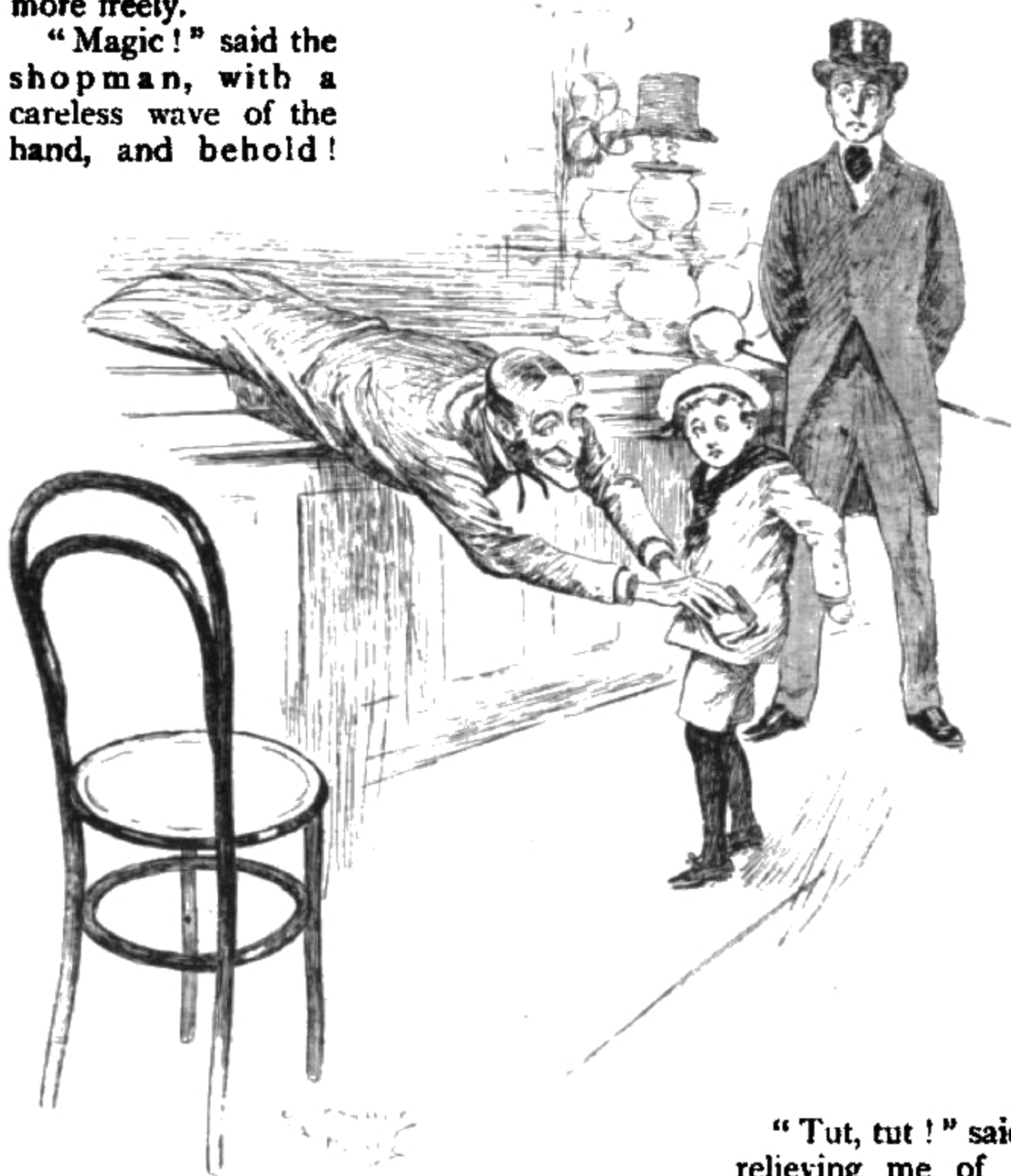
"THIS AMAZING PERSON PRODUCED THE ARTICLE IN THE CUSTOMARY CONJURER'S MANNER."

"Magic!" said the shopman, with a careless wave of the hand, and behold!