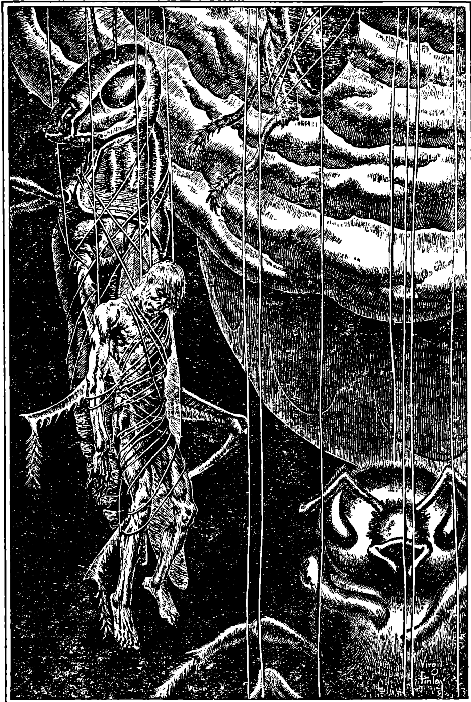
The Clotho spider's nest was decorated as no ogre's castle had ever been adorned—