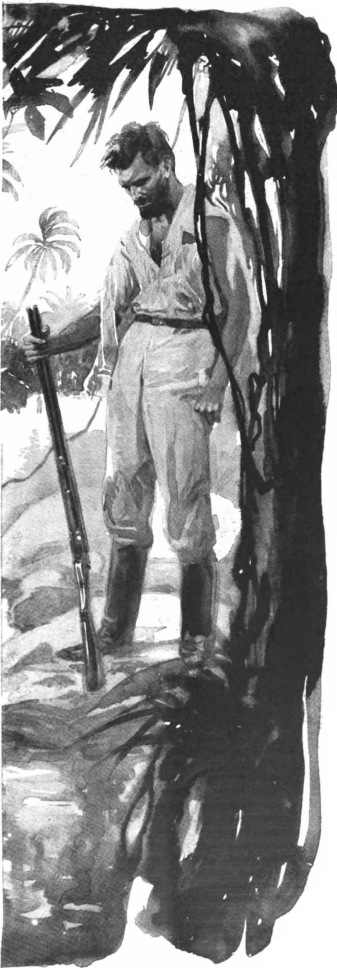
take her down to the stream for a vigorous scrubbing

Why the Star-born? In vain, Bassett interrogated Ngurn. According to that old devil-devil doctor, the Red One had always been just where he was at present, forever singing and thundering his will over men. But Ngurn's father, wrapped in decaying grass-matting and hanging even then over their heads among the smoky rafters of the devil-devil house, had held otherwise. That departed wise one had believed that the Red One came from out the starry night, else why—so his argument had run—had the old and forgotten ones passed his name down as the Star-born? Bassett could not but recognize something cogent in such argument. But Ngurn affirmed the long years of his long life, wherein he had gazed upon many starry nights, yet never had he found a star on grass-land or in jungle-depth—and he had looked for them. True, he had beheld shooting-stars (this in reply to Bassett's contention); but likewise had he beheld the phosphorescence of fungoid growths and rotten meat and fireflies on dark nights, and the flames of wood fires and of blazing candlenuts. Yet what were flame and blaze and glow when they had flamed and blazed and glowed? Answer: Memories, memories only, of things which had ceased to be, like memories of matings accomplished, of feasts forgotten, of desires that were the ghosts of desires, flaring, flaming, burning, yet unrealized in achievement of easement and satisfaction.