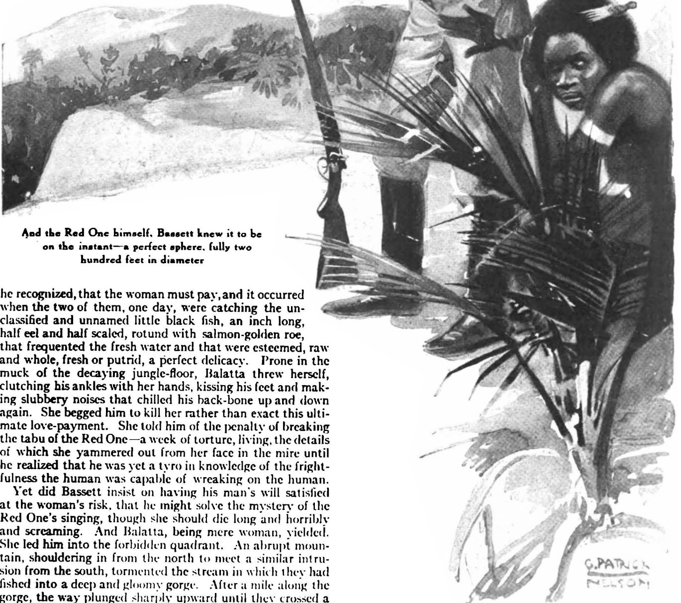
And the Red One himself. Bassett knew it to be on the instant—a perfect sphere, fully two hundred feet in diameter

he recognized, that the woman must pay, and it occurred when the two of them, one day, were catching the unclassified and unnamed little black fish, an inch long, half eel and half scaled, rotund with salmon-golden roe, that frequented the fresh water and that were esteemed, raw and whole, fresh or putrid, a perfect delicacy. Prone in the muck of the decaying jungle-floor, Balatta threw herself, clutching his ankles with her hands, kissing his feet and making slubbery noises that chilled his back-bone up and down again. She begged him to kill her rather than exact this ultimate love-payment. She told him of the penalty of breaking the tabu of the Red One—a week of torture, living, the details of which she yammered out from her face in the mire until he realized that he was yet a tyro in knowledge of the frightfulness the human was capable of wreaking on the human.