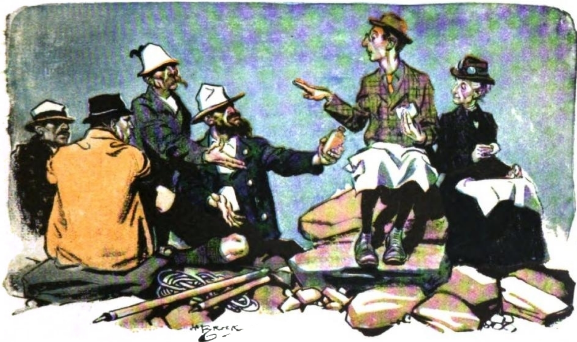
"THEY KICKED UP A TREMENDOUS SHINDY BECAUSE WE HAD BROUGHT GINGER CORDIAL."

"My dear," she said, the first time this