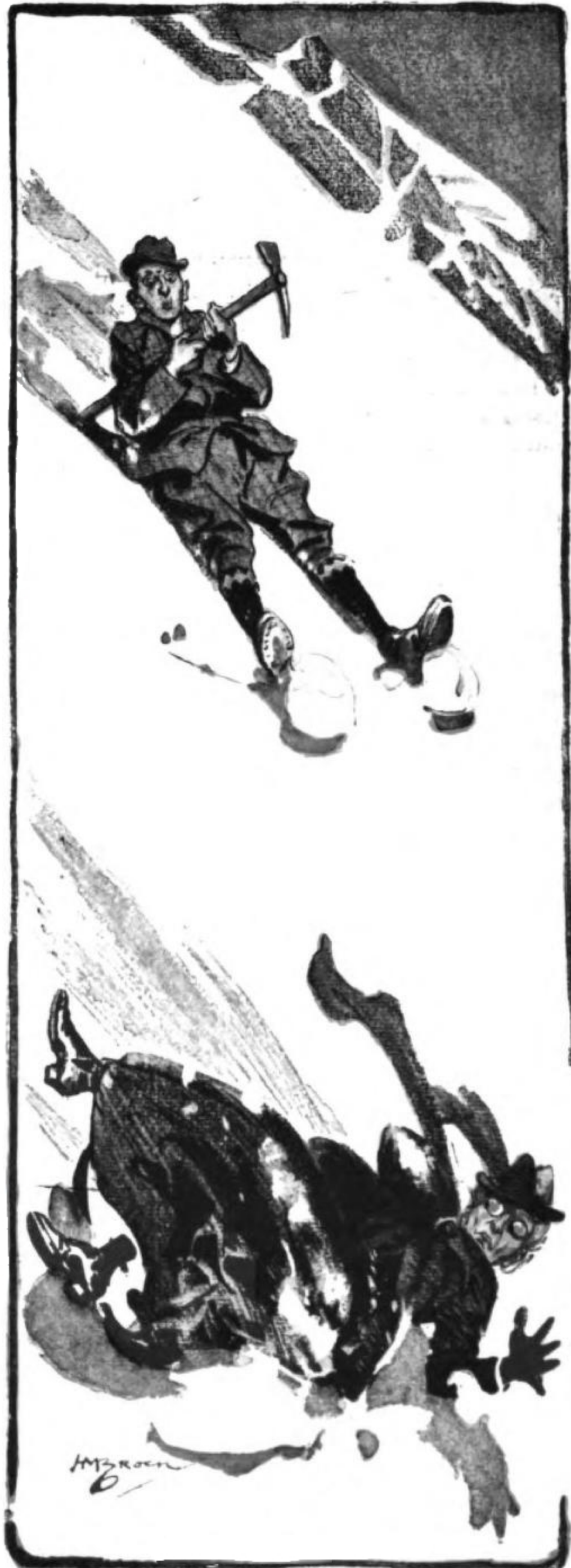
"MOTHER AND I DISCOVERED TWO DISTINCT WAYS OF COMING DOWN A MOUNTAIN."

I'd always thought falling must be horrible. It wasn't in the slightest degree. I might have hung with my clouds and lumps of snow about me for weeks, so great was my serenity. I had an impression then that I was as good as killed — and that it didn't matter. I wasn't afraid — that's nothing! — but I wasn't a bit uncomfortable. Whack! We'd hit something, and I expected to be flying to