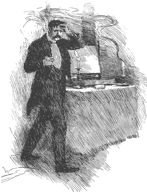
“I WAS ALONE.”