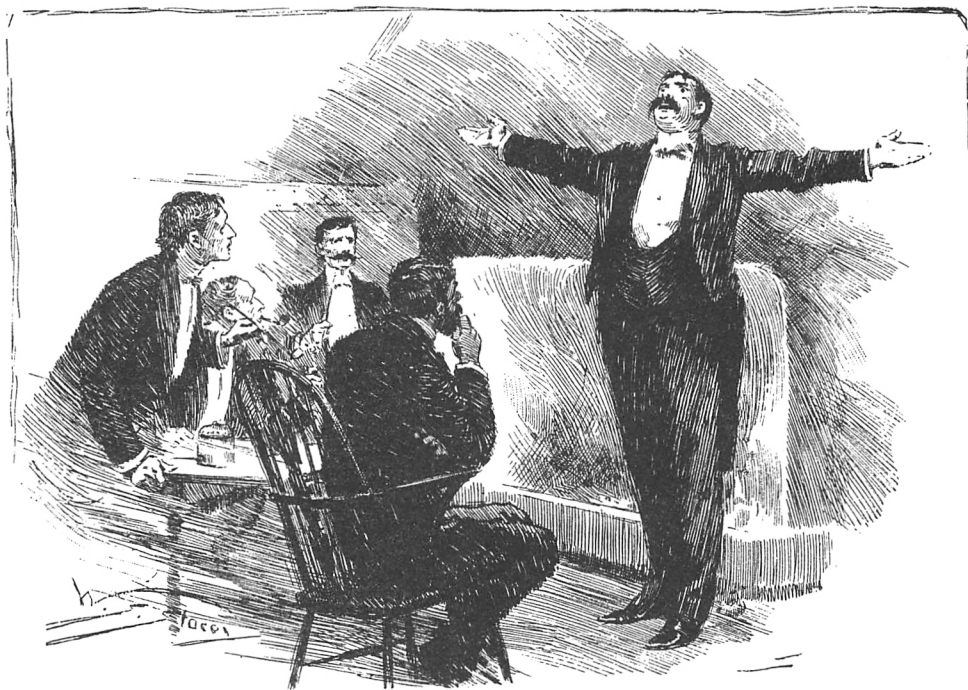
"HE STOOD THERE, VERY GENTLY SWAYING."

changes when its lights are suddenly extinguished. His eyes were suddenly eyes that are fixed, his smile was frozen on his lips, and he stood there still. He stood there, very gently swaying.